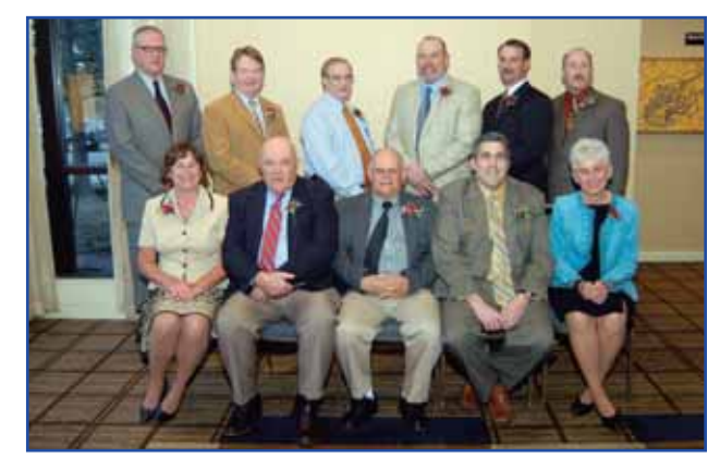
Chapter Award Winners